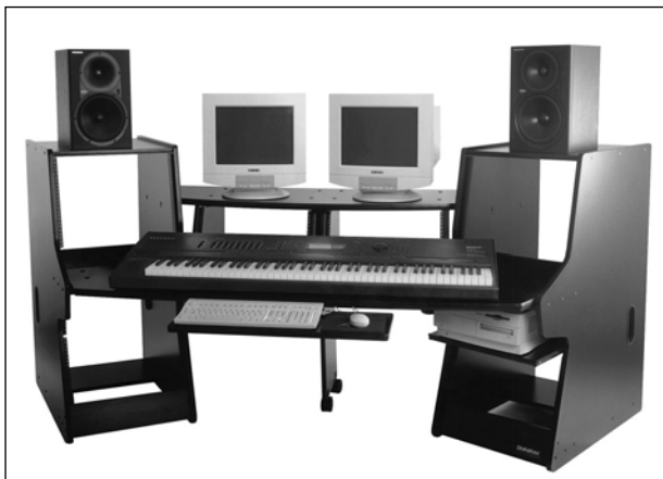
Figure 12.1. Omnirax Studio furniture

After your studio space has been defined, you will need furniture to complete the setup. If you are particularly handy, you can make your own, but given the price of materials, some prefabricated units can actually be cheaper. A small studio setup may fit on stock office furniture or a computer desk with a library top. For more complex setups you may want to investigate units built specifically for recording by companies including Raxxess, Omnirax, and Argosy.