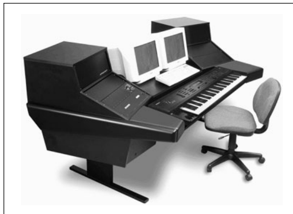
Figure 12.2. Argosy Studio furniture

These products are designed for audio and video hardware gear. Each company offers a variety of options so it is a good idea to review each company's catalog offerings.