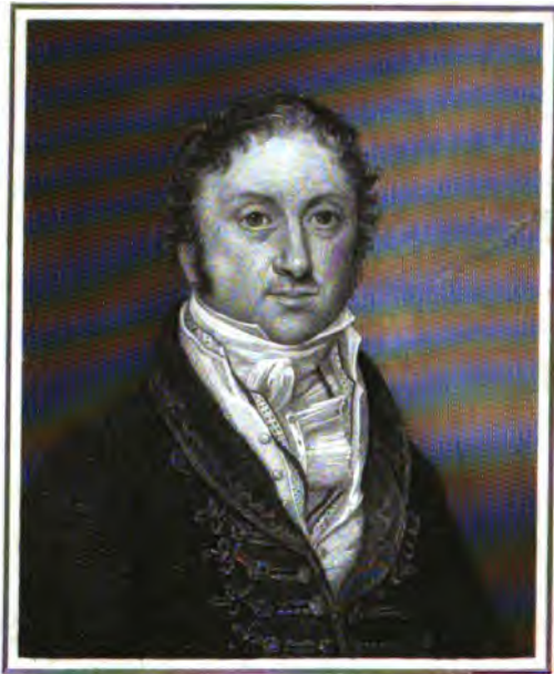
Painted by W Childs.