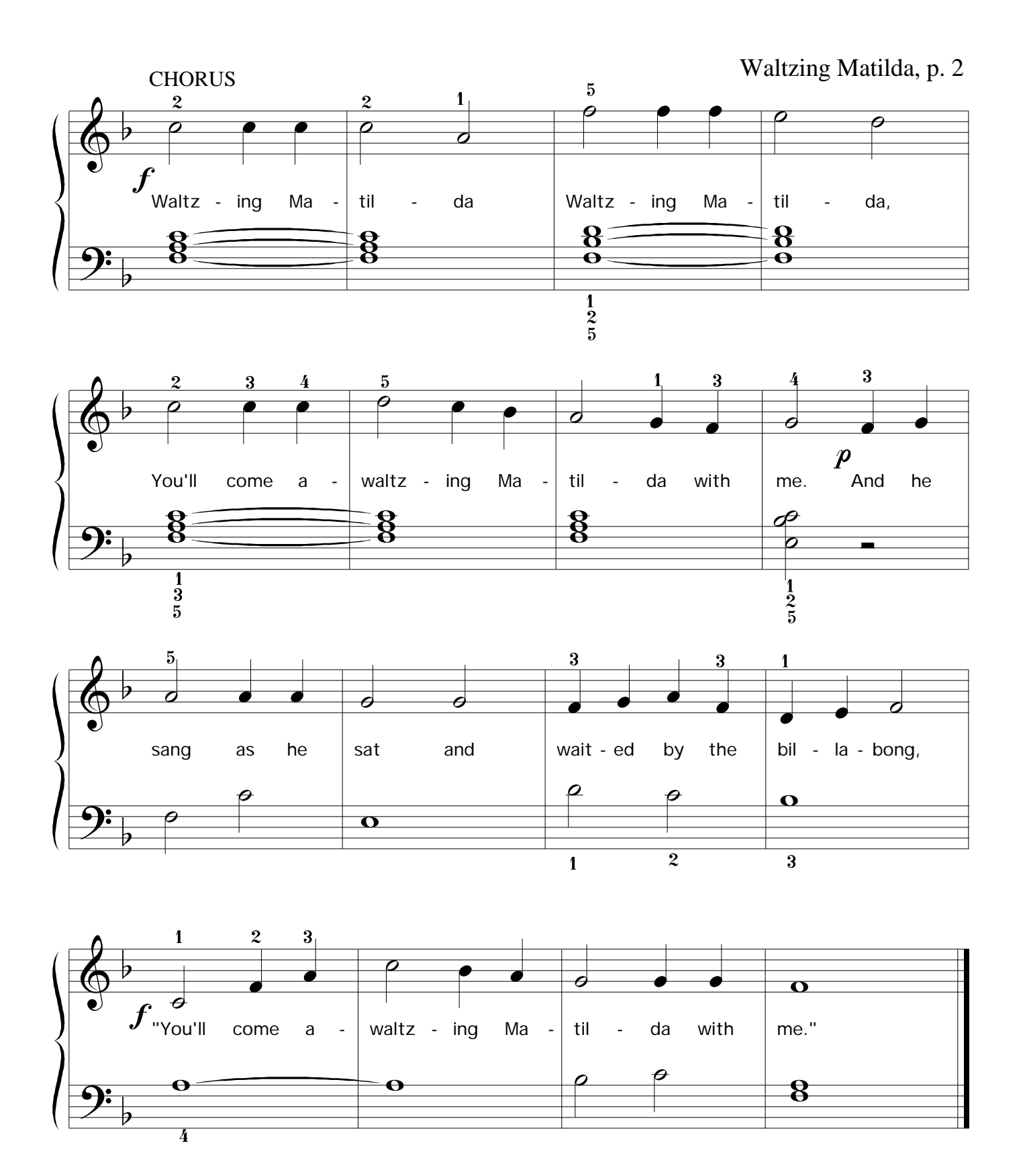
2. Down came a jumbuck to drink at the billabong, Up jumped the swagman and grabbed him with glee, And he sang as he stowed that jumbuck in his tuckerbag, "You'll come a-waltzing Matilda with me."